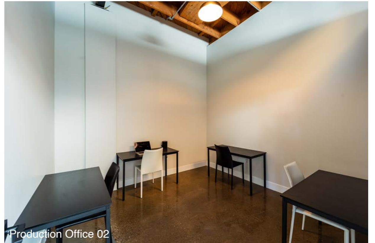
Production Office 02